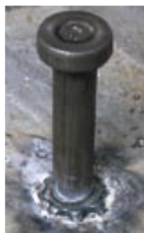
Figure 2: Example of 360° Flash.