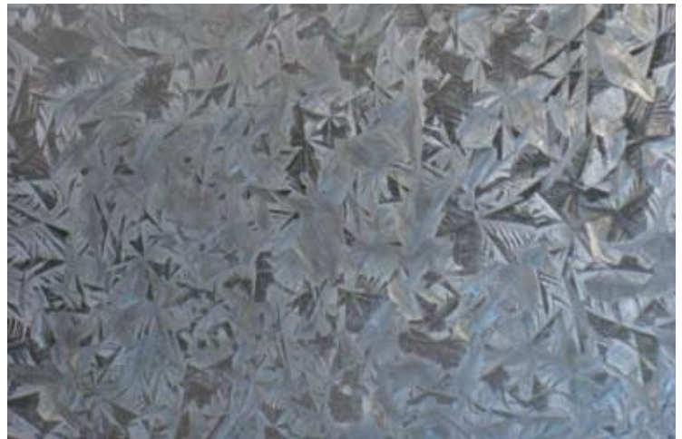
The distinctive "spangle" pattern of galvanised steel