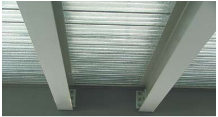
Galvanised steel decking

coating. The result is a coating that is not ductile. Batch galvanising is predominantly used for protecting pre-fabricated steel articles.