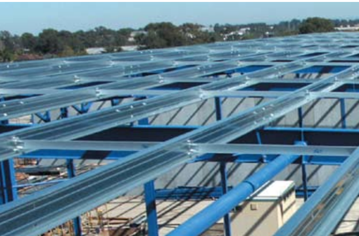
Galvanised steel purlins