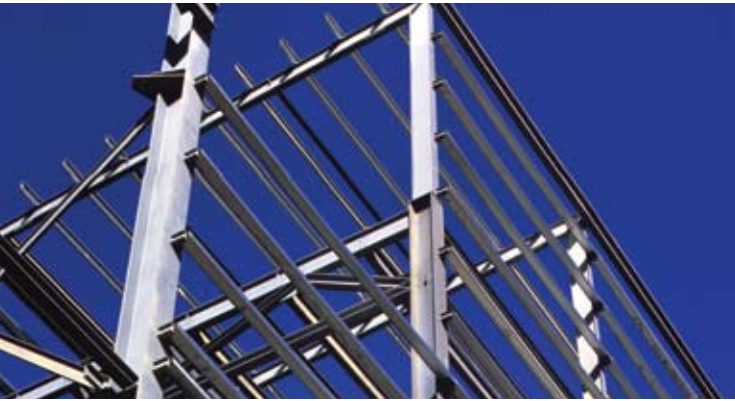
Galvanised steel purlins

and aesthetics. As referred to above in 'expected service life', a galvanised zinc coating of Z160 for roofing and walling would severely compromise its performance.